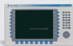
HMIs & Electronic Controls

Process Pump Repair – We have several facilities available to service and repair your pump and related equipment. Our repair operations are fully equipped with machinery capable of handling every step of the process, including: Complete Refurbish and Reconditioning, Machining & Welding, Dynamic Balancing, Fabrication & Assembly, Pump and Motor Alignment, Part Reproduction for Damaged or Obsolete Part Replacement