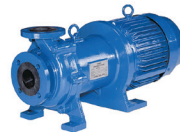
Fluid Process & Flow Control