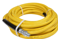
Hyd & Ind Hose & Fittings