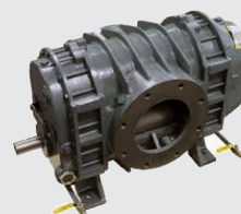
Vacuum Pumps & Blowers