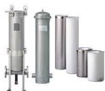
Filters & Housings