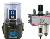
Pneumatics & Process Controls