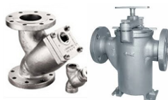
Strainers, Y-Strainers & Baskets