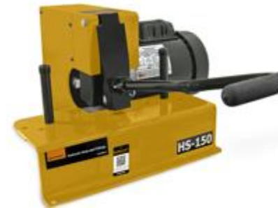
HS-150 Saw (20614553)