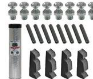
PC150HD Spare Parts Kit (21099232)