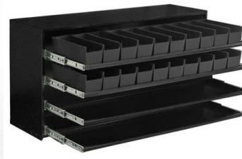
Hydraulic Fittings Bin (20240780)