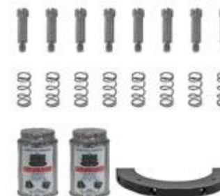
PC150 Spare Parts Kit (21053594)