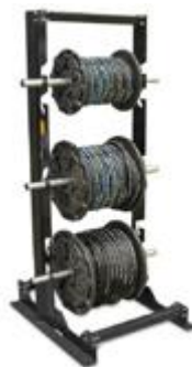
36" Hose Rack (21024823)