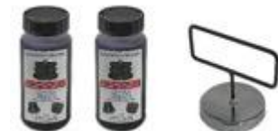
RCD Spare Parts Kit (21053593)