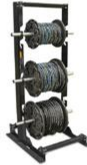
36" Hose Rack (21024823)