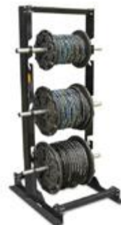
36" Hose Rack (21024823)