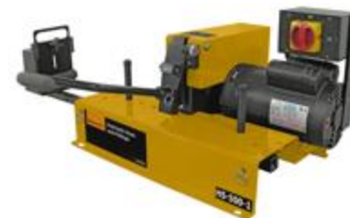
HS-501 Saw (20614557)