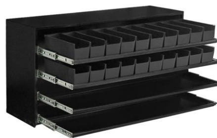
Hydraulic Fittings Bin (20240780)