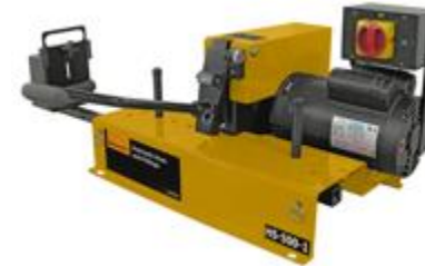
HS-501 Saw (20614557)