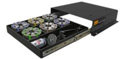
PC125RCD Skit w/ 8 dies & cabinet (20809573)